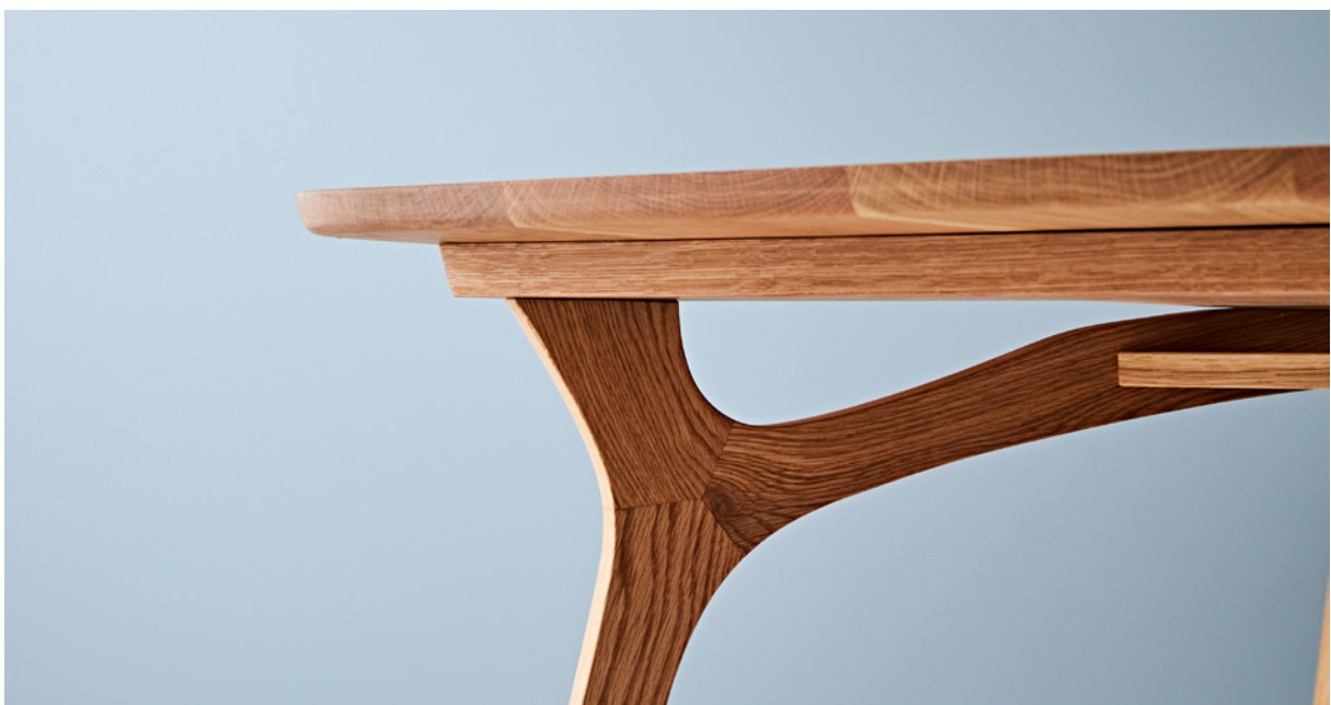
LYSSNA DINING TABLE