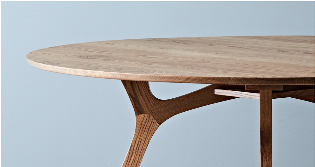
LYSSNA ROUND DINING TABLE