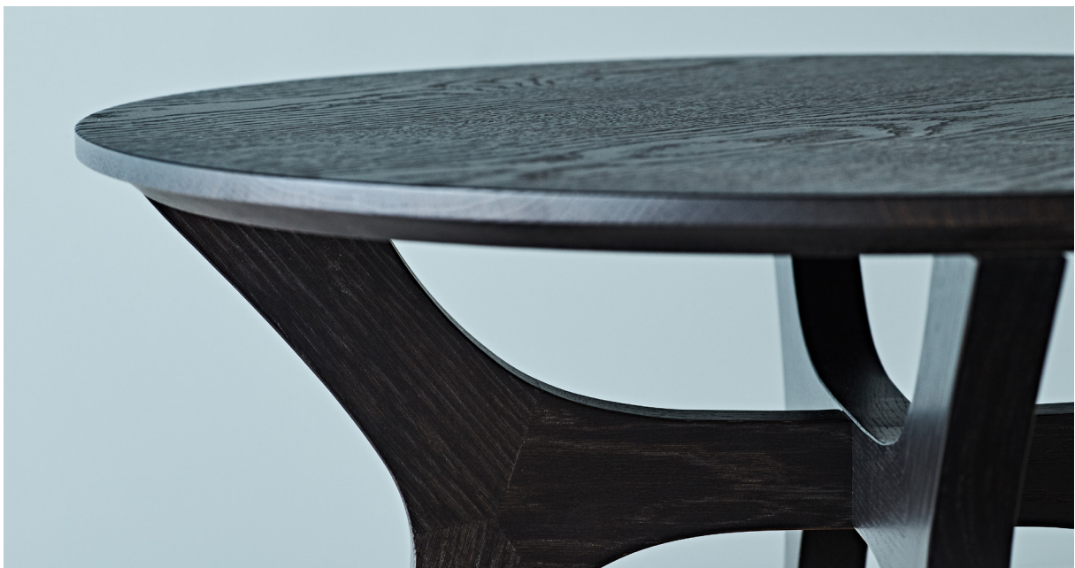
LYSSNA SIDE TABLE